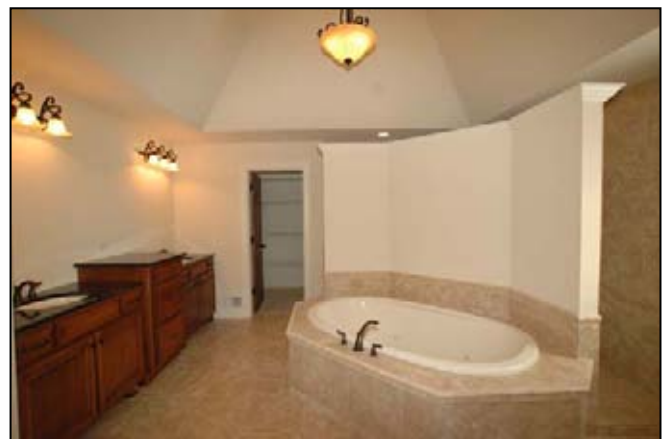
With a master bath fitting of the Queen including double vanities, make-up vanity area, oversized whirlpool tub, volume ceiling and walk in dual shower design.