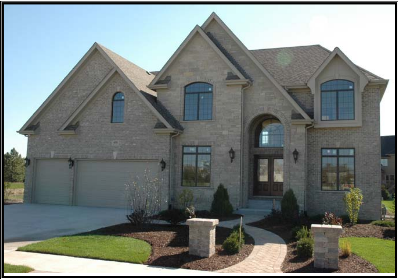
* Photo of similar home