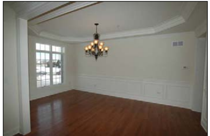
A formal dining room with decorative ceiling, wainscoting and crown moulding to enhance your dining ambiance.