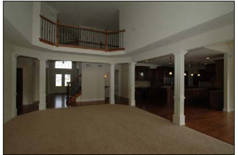
Open Floor Plan with focus on family space.