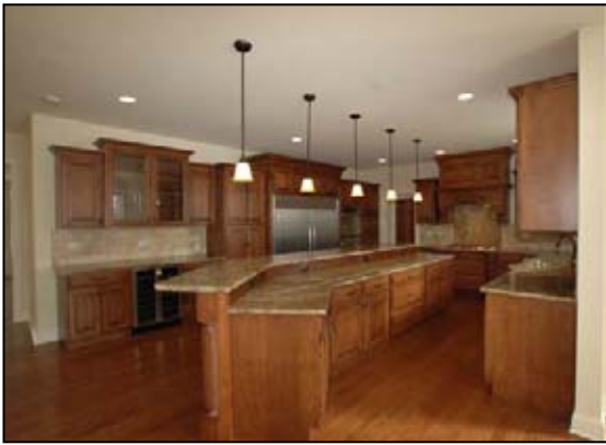
A Gourmet Kitchen With Custom Amish Cabinets