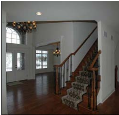
A grand foyer with hardwood flooring and solid oak staircase greets you at the entry.